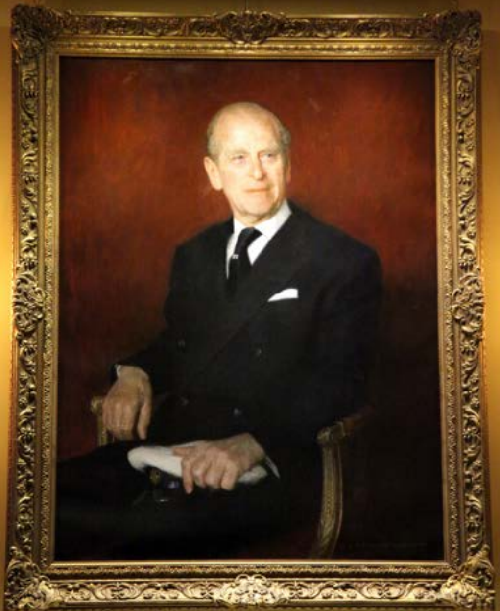
HRH Duke of Edinburgh : Royal Yacht Squadron