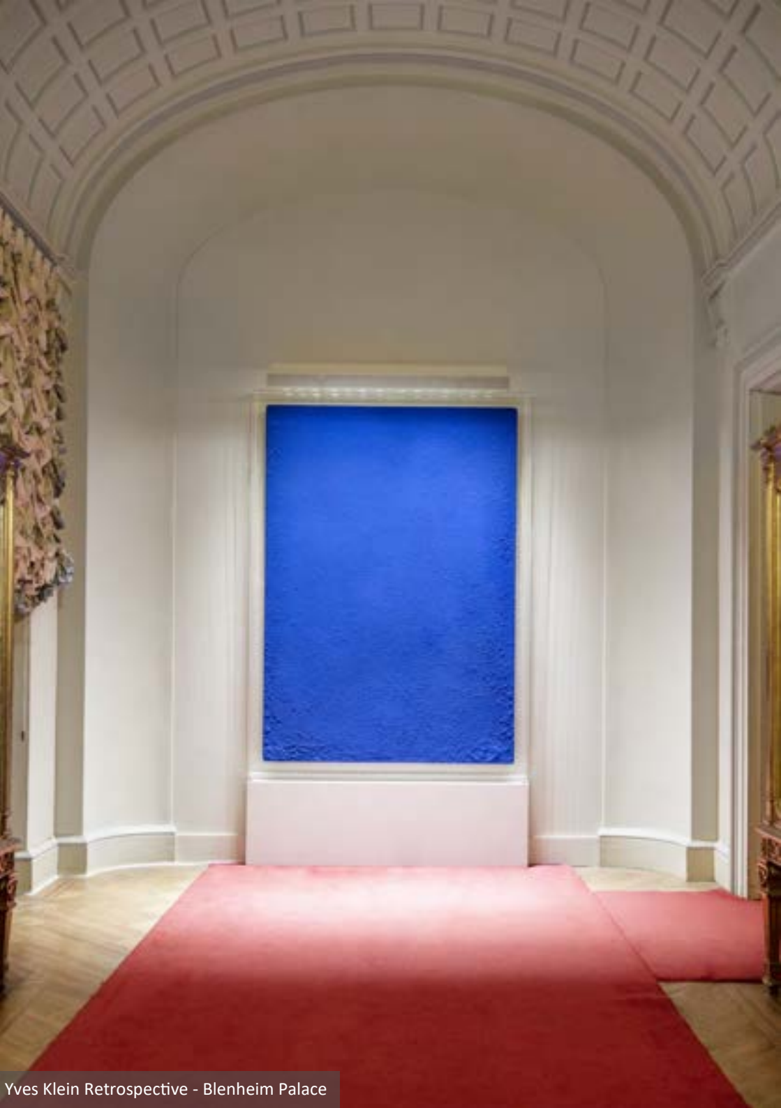
Yves Klein Retrospective - Blenheim Palace