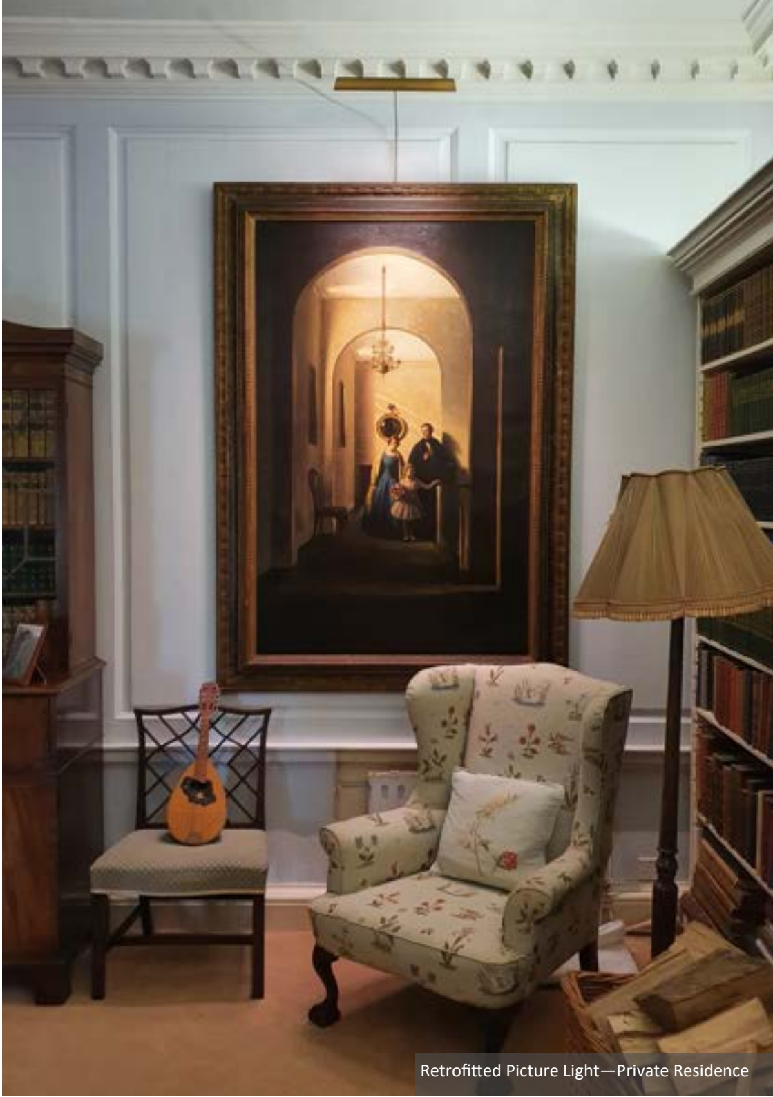
Retrofitted Picture Light—Private Residence