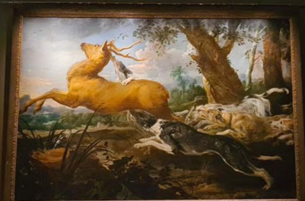
Hunting Scene : Private Residence

Well - distributed lighting can now be tailored to suit either a landscape or a portrait painting Look at the difference of this before and after situation!