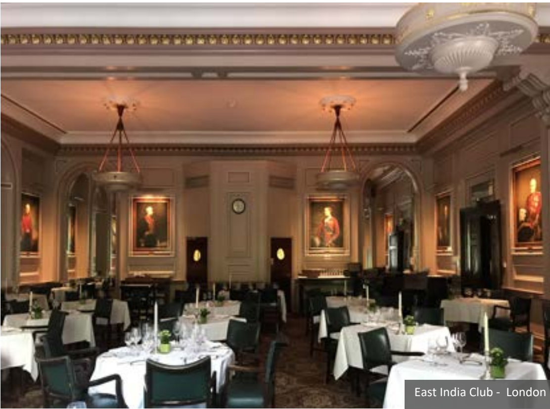
East India Club - London

The red colours in these two collections of paintings are represented richly under the very best quality of light