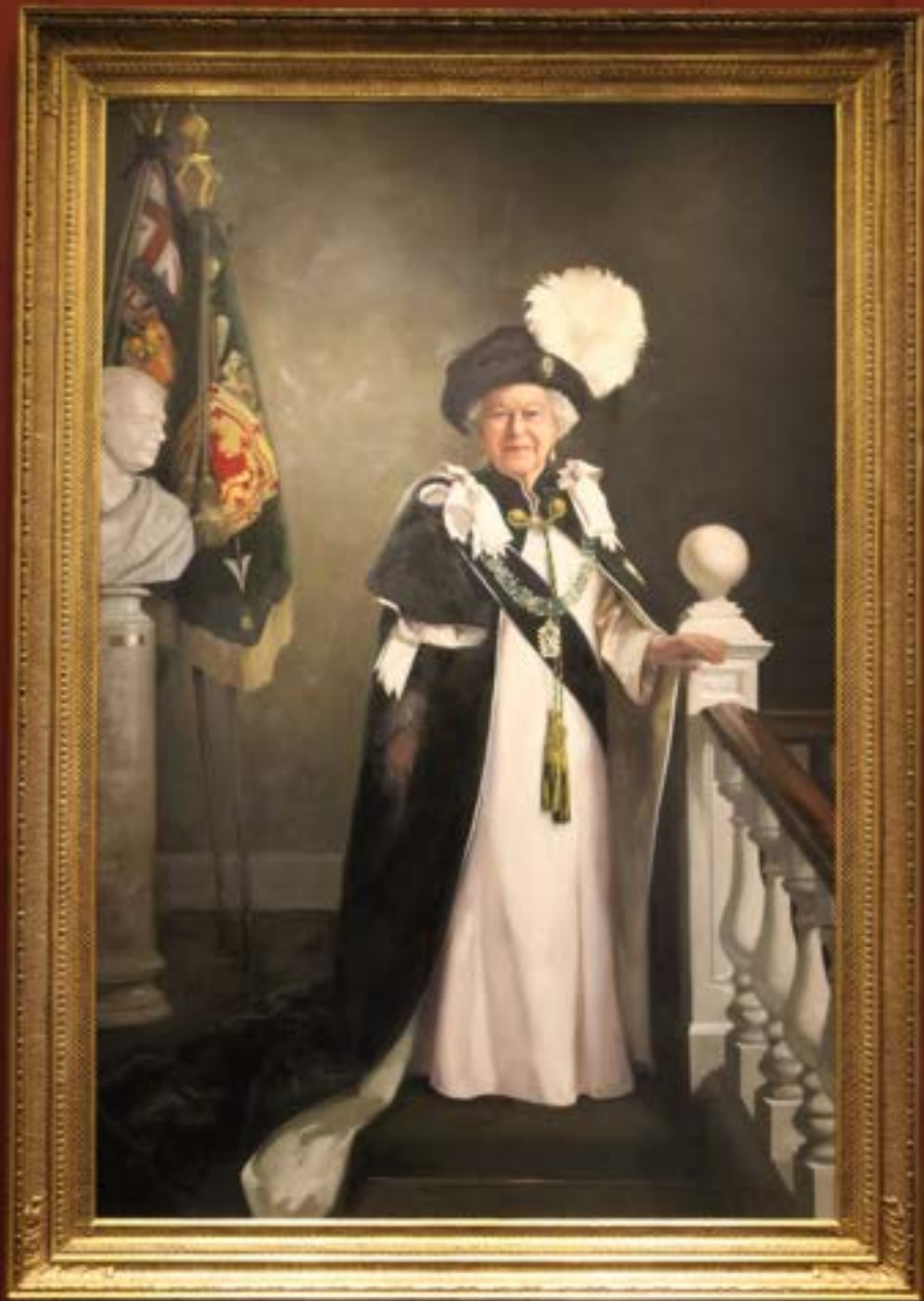
Her Majesty Queen Elizabeth II - Archers' Hall, Edinburgh