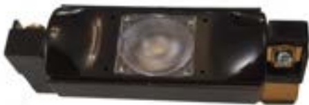
A detachable, and replaceable, LED module ensures future maintenance is assured.

You may want to hold a few individual LED modules in reserve in your cupboard – where, of course, you used to store your substantial maintenance hoard of incandescent and halogen replacement light bulbs; so not too much hardship in that.