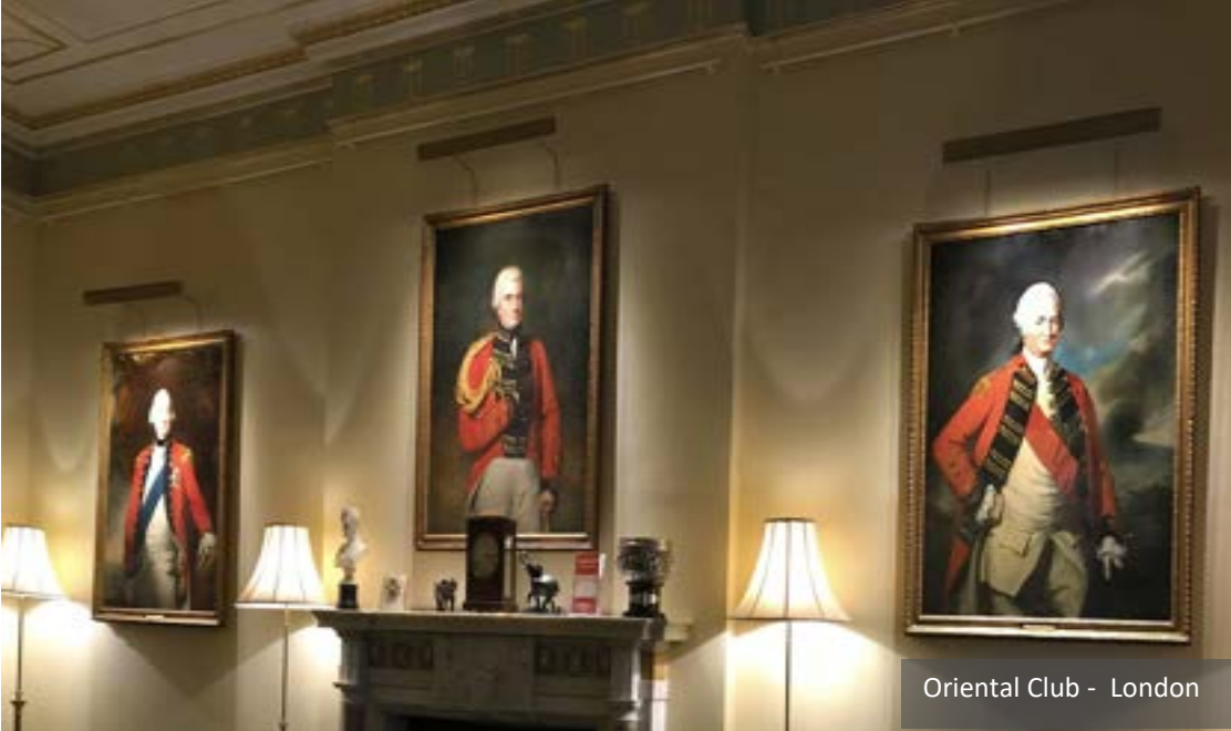
Oriental Club - London

The red colours in these two collections of paintings are represented richly under the very best quality of light